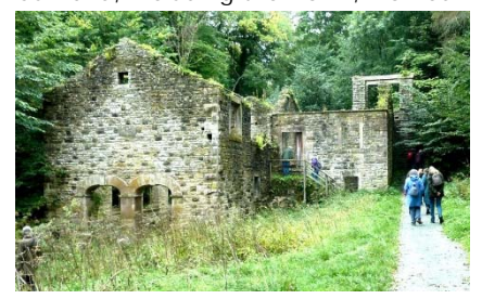
At the Howk bobbin mill

A leisurely lunch was taken at the Oddfellows Arms, and we can certainly vouch for the quality of the food there. We struggled out for our afternoon guided walk around the village and its industrial sites, which had clearly spread from the old centre and up the becks towards the fells. The Howk, a series of waterfalls, gave its name to a large bobbin mill, of around 1847, set in a deep ravine cut by Cald Beck. The water-powered bobbin mills of Cumbria, including the Howk, worked