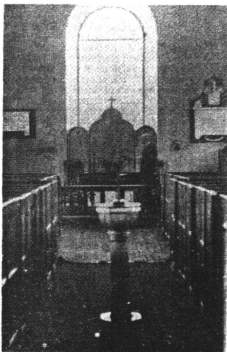
Interior before 1884