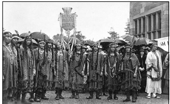
Lorton WI, as North American Indians, winning 2nd prize at Greystoke Castle in 1924 in the competition to represent a foreign country.