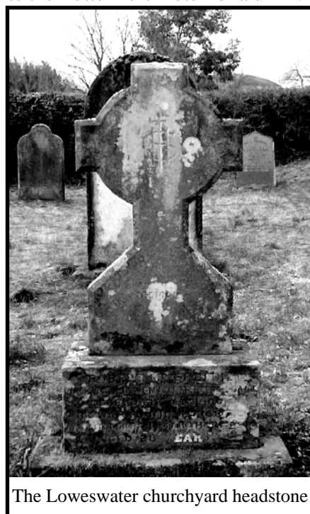
The Loweswater churchyard headstone