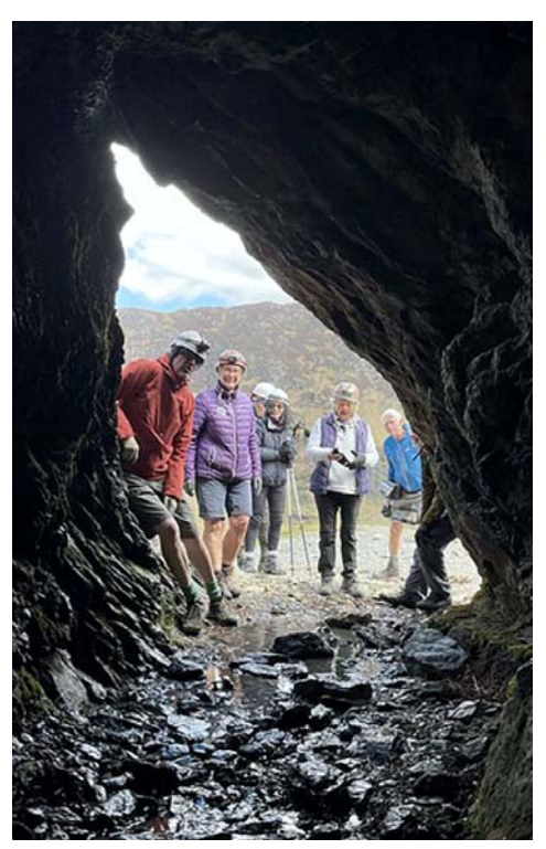
Looking into the St George Level

was used for pumping water out and lifting stone for crushing.