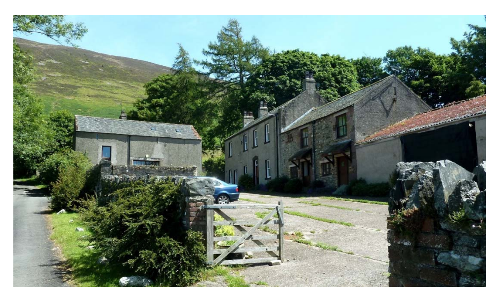
The Hope, approached from Hopebeck. Situated at the exit of Hope Beck from the 'hop' valley, which commences above and to the right.