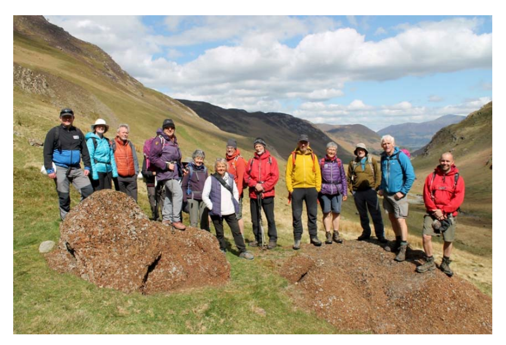
The group standing on copper ore

mines, what was recovered etc. Similar records from later Victorian mining do not seem to exist.