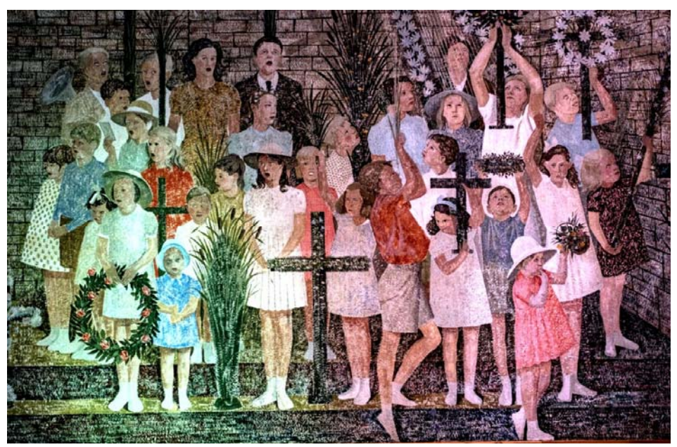
The rushbearing mural in the Church, made by the evacuated students of the Royal College of Art, using local models.

of the lives of a generation whose memories were first to be recorded in sufficient numbers. The general history of WWII is a subject with which all society members will be familiar, allowing oral history to provide that additional dimension of personal experience, but in the form of recollections rather than contemporary records. Are the recordings primary or secondary historical sources? That's something to ponder over.